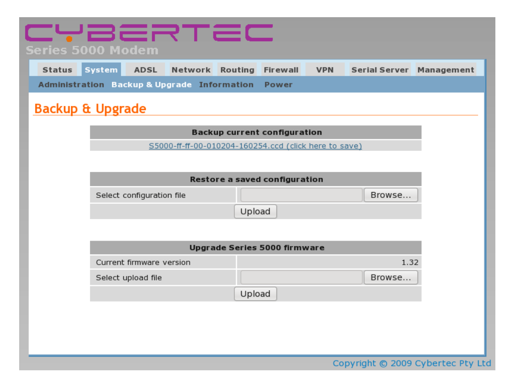
Figure 1: The System Backup & Upgrade page.

• Select System > Backup & Upgrade. The System Backup & Upgrade page will be displayed as shown in Figure 1.