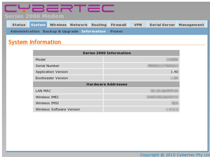
Figure 7: The System Information page after the upgrade.