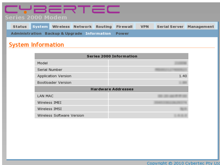
Figure 7: The System Information page after the upgrade.