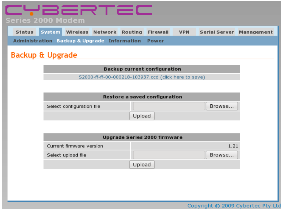
Figure 1: The System Backup & Upgrade page.