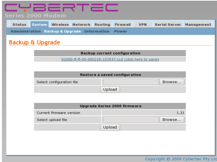
Figure 1: The System Backup & Upgrade page.