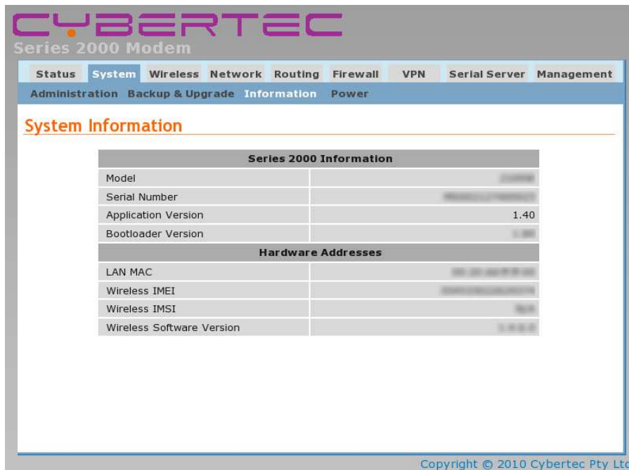
Figure 7: The System Information page after the upgrade.