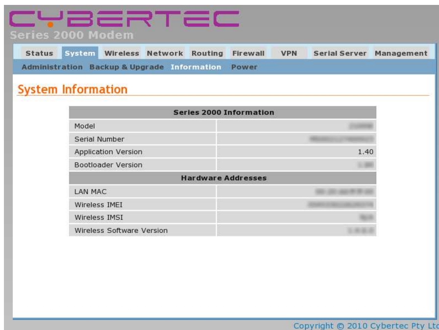
Figure 7: The System Information page after the upgrade.