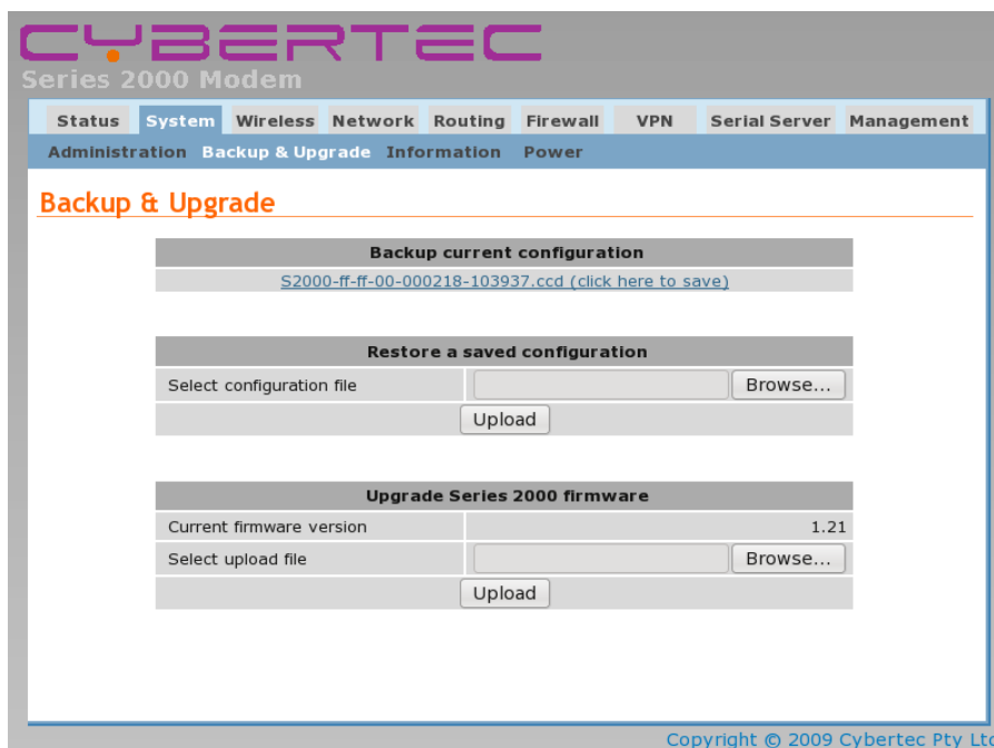
Figure 1: The System Backup & Upgrade page.