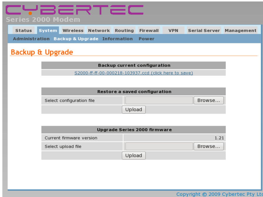
Figure 1: The System Backup & Upgrade page.