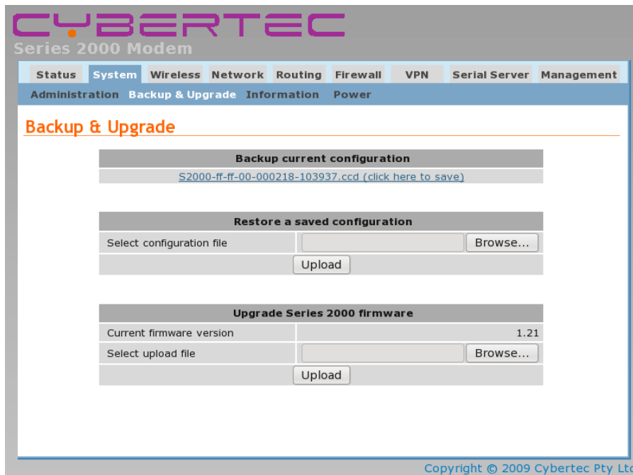
Figure 1: The System Backup & Upgrade page.