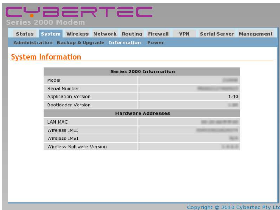
Figure 7: The System Information page after the upgrade.